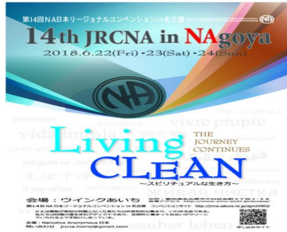
JRCNA14 in NAGOYA

NAGOYA is center of Japan where is between Tokyo and Osaka Very lively big-city in Japan. You can do a Pre-registration from Feb 1st!